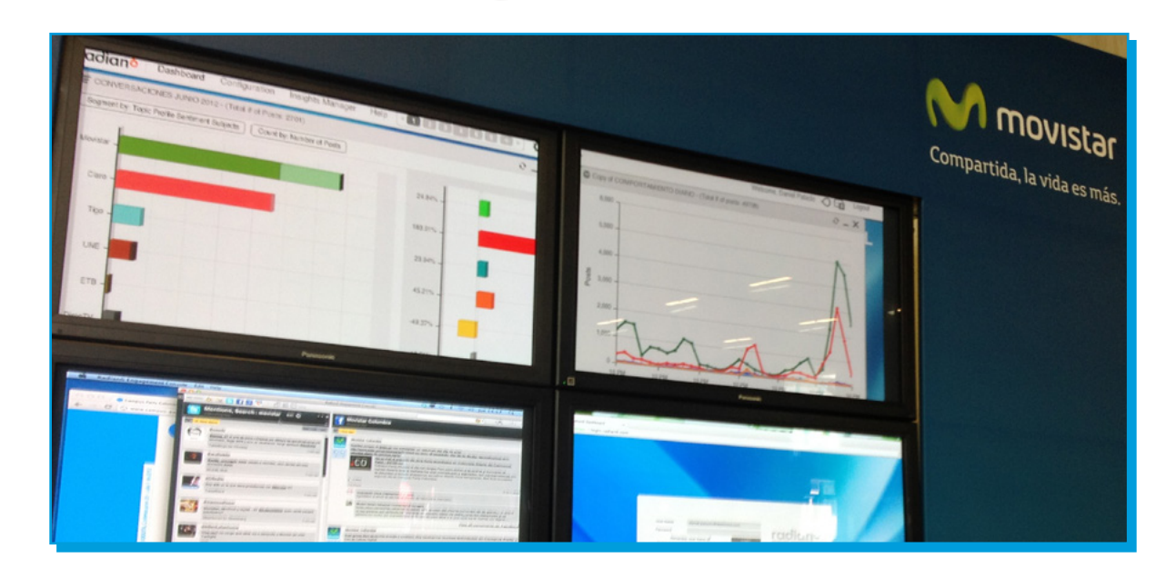
Movistar Colombia's remote Social Media Command Center at Campus Party 2012

Social Media Command Centers are being utilized across the globe. Movistar Colombia has two social media command centers. One is permanently located at their offices and the other is a remote set up which moves to and from their different events, such as Campus Party 2012. They use their remote command center to monitor and manage social media and customer service issues.